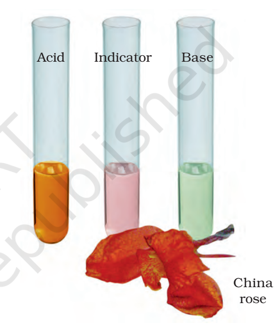
Fig. 5.3 China rose flower and indicator prepared from it

Now I understand why a turmeric stain on my white shirt is turned to red when it is washed with soap. It is because the soap solution is basic.