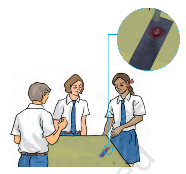
Fig. 5.2 Children performing litmus test

The solutions which do not change the colour of either red or blue litmus are known as neutral solutions. These substances are neither acidic nor basic.