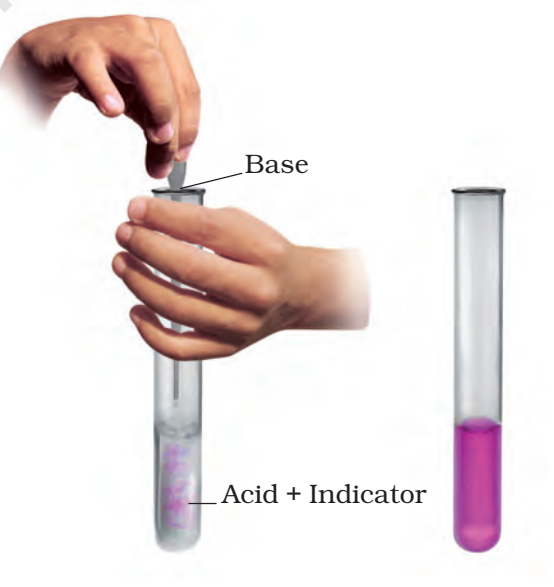
Fig. 5.4 Process of neutralisation

It is evident that when the solution is basic, phenolphthalein gives a pink colour. On the other hand, when the solution is acidic, it remains colourless.