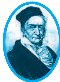
Carl Friedrich Gauss (1777 – 1855)

Carl Friedrich Gauss is often referred to as the 'Prince of Mathematicians' and is considered one of the three greatest mathematicians of all time, along with Archimedes and Newton. He has made fundamental contributions to both mathematics and science.