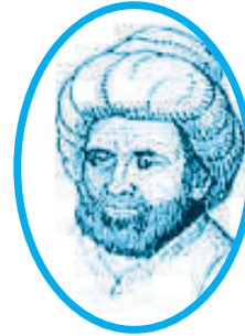
Muhammad ibn Musa al-Khwarizmi (C.E. 780 – 850)

A lemma is a proven statement used for proving another statement.