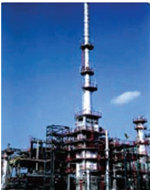
Fig. 5.5: A petroleum refinery

separating the various constituents/fractions of petroleum is known as refining. It is carried out in a petroleum refinery (Fig. 5.5).