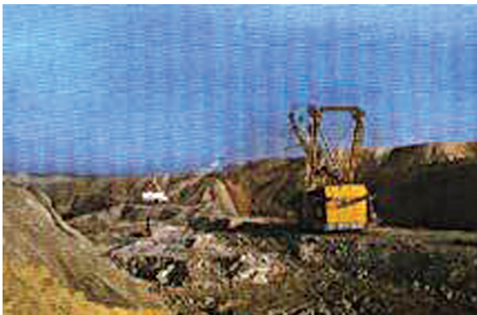
Fig. 5.2: A coal mine

When heated in air, coal burns and produces mainly carbon dioxide gas.