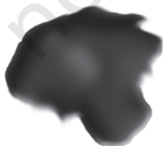
Fig. 5.3: Coal tar

It is a black, thick liquid (Fig. 5.3) with an unpleasant smell. It is a mixture of