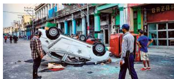
A police car seen overturned after a protest against Cuban President Miguel Diaz-Canel in Havana on Monday.