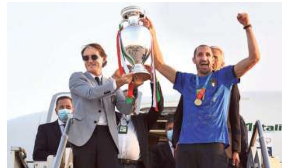
Triumphant return: Coach Roberto Mancini and captain Giorgio Chiellini display the Henri Delaunay Trophy after arriving in Rome.