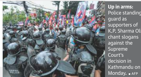
Up in arms: Police standing guard as supporters of K.P. Sharma Oli chant slogans against the Supreme Court's decision in Kathmandu on Monday.

■ He again advises the President to dissolve Parliament and hold new