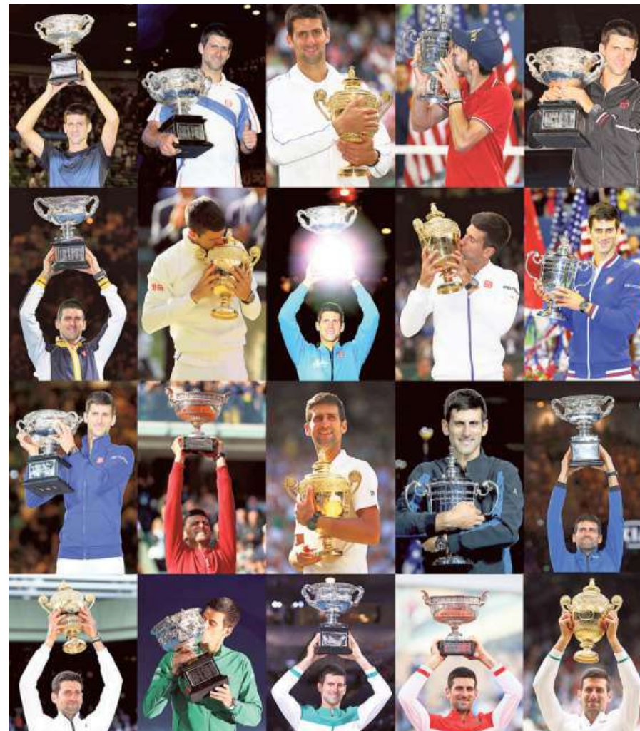
Impressive array: Djokovic with his Grand Slam trophies.