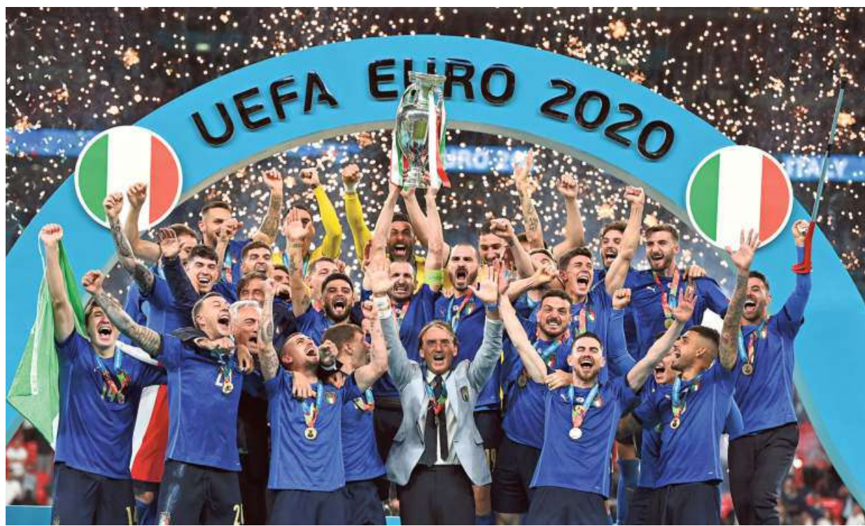
A night to remember: Italy's long wait for a second European title came to an end on Sunday.

Saka's kick was repelled by Gianluigi Donnarumma to give Italy the Henri Delaunay Trophy for the second time, completing a remarkable turnaround for a team that failed to even qualify for the 2018 World Cup.