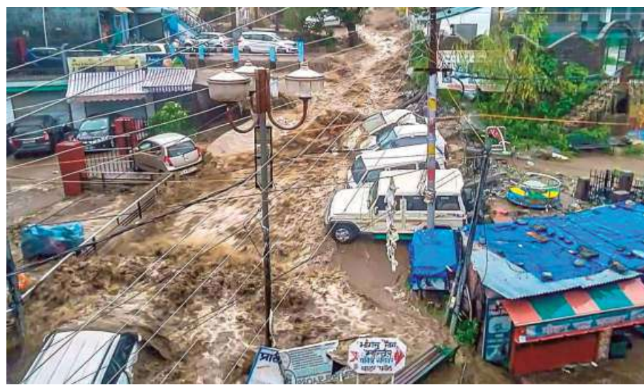
Caught unawares: Floodwaters surging through a street in Mcleodganj, Himachal Pradesh, following a cloudburst on Monday. The raging torrents damaged cars and buildings. ■PTI