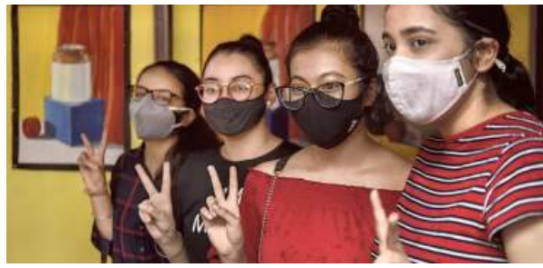
Students celebrate after the announcement of CBSE Class XII results in New Delhi on Friday.

The board came out with an alternative policy for assessment that was cleared by the Supreme Court on June 17. The policy gave 40% contribution to marks obtained by students in Class XII based on unit test/mid-term and pre-board examination, 30%