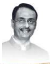
- Dr. Dinesh Sharma Hon'ble Deputy Chief Minister of Uttar Pradesh

RANKED NO. 1 PRIVATE UNIVERSITY No.1 for Highest No. of E-Content 2021 by Higher Education Online Digital Library, Govt. of Uttar Pradesh