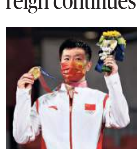
Ma Long... paddler supreme.