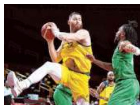
Aron Baynes.

Australia suffered a blow to its men's basketball gold medal hopes on Friday with Toronto Raptors star Aron Baynes ruled out of the rest of the Olympics with a neck injury exacerbated by a bathroom fall. Baynes is expected to recover, but not in time to return to the court in Tokyo.