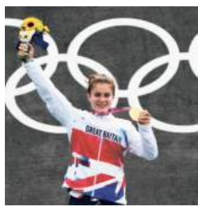
Bethany Shriever.

Britain's Bethany Shriever ended Mariana Pajon's Olympic reign to win the women's BMX racing competition on Friday as Dutch rider Niek Kimmann