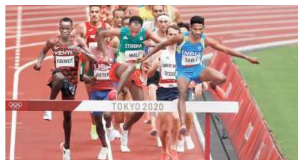
Silver lining: Steeplechaser Sable ensured a spot at next year's Worlds despite not making the final in Tokyo.

Sable improved his personal best by more than two seconds, clocking 8:18.12s. That time, which also saw him make the entry standard for next year's Worlds in the USA, was 13th best overall but three athletes with slow-