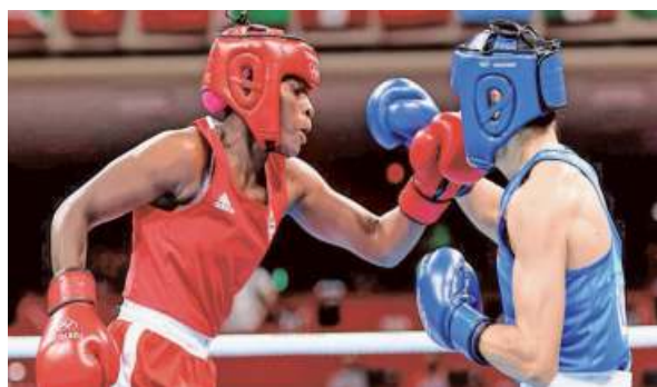
Motivated: Oshae Jones, left, did not let her travails bog her down against Maria Moronta.