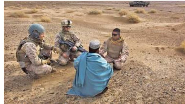
New home: U.S. soldiers speaking to an Afghan man with the help of a translator in Helmand province.

Some estimates suggest the total number of prospective evacuees under what has been dubbed "Operation Allies Refuge" could be as high as 1,00,000 once relatives are included.