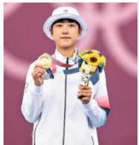
An San... triple delight.