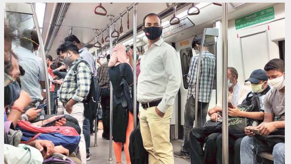
Long lines outside metro stations and at bus stops are a common sight across the city as authorities are attempting to implement COVID-19 safety guidelines by regulating entry of commuters.