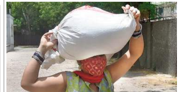
The survey conducted by CPI(M) shows 27% of households got less than 5 kg ration per person in May.

Hon'ble Minister Panchayati Raj Government of Uttar Pradesh