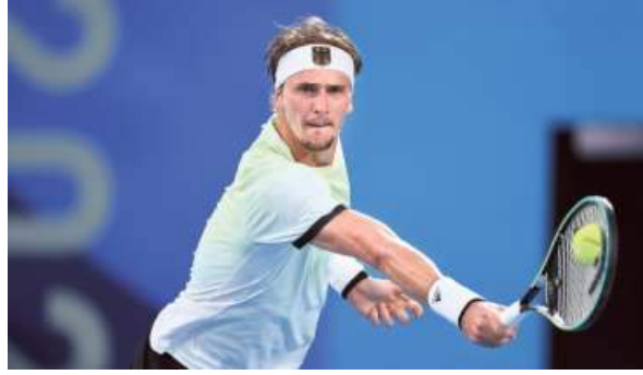
Dream dasher: Zverev ended Djokovic's attempt to add the Olympic gold to his trophy cabinet.

Mektic and Pavic take gold in all-Croatian men's doubles affair