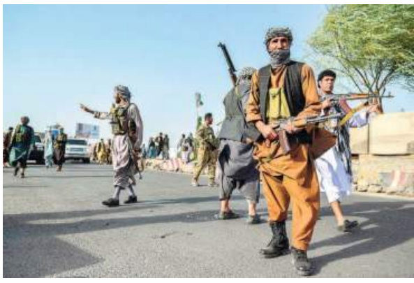
On vigil: Afghan security personnel and militia fighting against Taliban in Enjil district, Herat province, on Friday.

"Took stock of progress made since our Geneva meeting and discussed bilateral, regional and global issues of mutual interest," he said, adding that the two