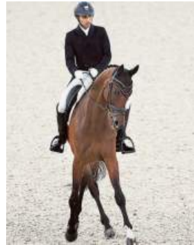
Fouaad Mirza on Seigneur Medicott.

Fouaad Mirza, astride Seigneur Medicott, was seventh with 28 penalty points in dressage on day one of the equestrian competition on Friday. Louise Romeike of Sweden was tied with the Indian. Great Britain's Oliver Townend topped the table with 23.60 penalty points.