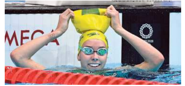
The crown sits well? Emma McKeon celebrates winning the women's 100m freestyle gold.

China's Wang Shun upset the field to win the 200m medley in 1:55.00s ahead of Britain's Duncan Scott and Switzerland's Jeremy Desplanches.