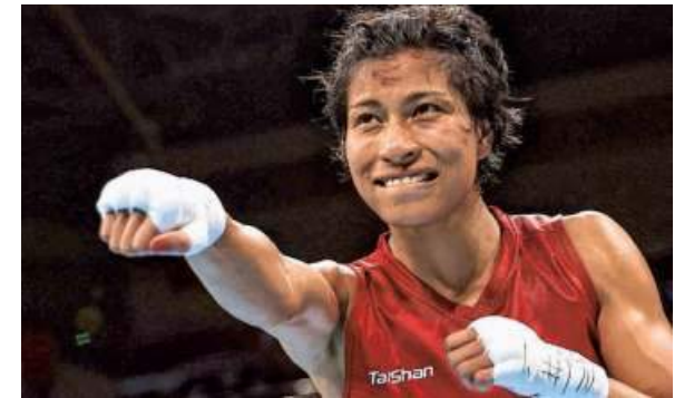
Fearless: Lovlina has stung opponents like a bee.