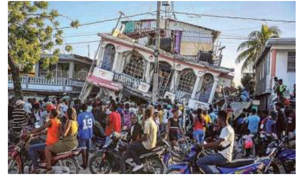
People outside the Petit Pas Hotel, destroyed by the earthquake in Les Cayes, Haiti, on Saturday.

Fear is running high among the ethnic Hazara minority, Shia Muslims who were persecuted by the Taliban and made major gains in education and social status over the past two decades.