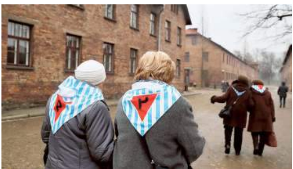
Survivors and guest walk past the barracks at the former concentration camp in Auschwitz, Poland.

Polish President Andrzej Duda earlier in the day signed the law, which ad-