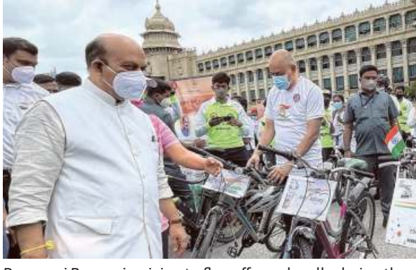
Basavaraj Bommai arriving to flag off a cycle rally during the Independence Day celebrations in Bengaluru.

"The State government is awaiting the approval of the Centre on the Detailed Project Report on the Mokedatu drinking water project to utilise the additional water allocated by the Cauvery Water Disputes Tribunal and Supreme Court," he said in his Independence Day address after hoisting the Tricolour here. "We will implement the Mokedatu project despite opposition from the neighbouring States. Our government will not back off from this project, which is necessary for drinking water and power generation."