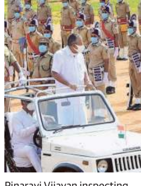
Pinarayi Vijayan inspecting the guard of honour at the Independence Day parade in Thiruvananthapuram.

'Ecology an investment' The Chief Minister also used the opportunity to lay stress