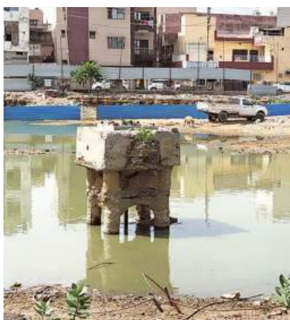
The parking projects of the Municipal Corporation of Gurugram are running behind schedule.

"This year, too, a lot of time was lost due to the lockdown restric-