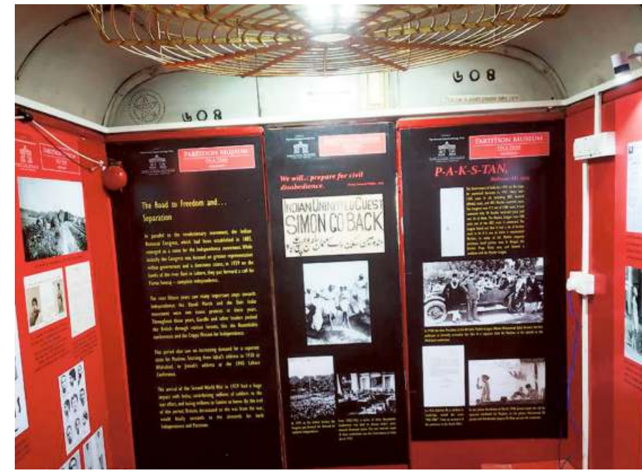
Posters and photographs on display at the museum on wheels in Kolkata.

The museum was inaugurated by Minister of Transport and Housing Firhad Hakim. "The museum on wheels beautifully depicts the efforts of our freedom fighters and also the impact of the division of Bengal and