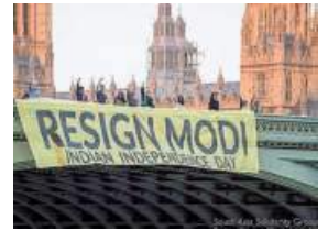
Protesters on Westminster Bridge.

The organisers pointed out violence against the Muslim community, sexual violence against Dalit women and girls, corporate dominance of agriculture,