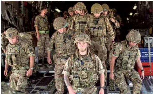
At the ready: Members of U.K.'s 16 Air Assault Brigade arrive in Kabul to assist with evacuation of British nationals.

On Sunday, the insurgents entered the outskirts of Kabul but initially remained outside of the city's downtown. Meanwhile, Taliban