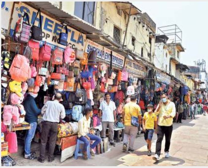
Government agencies are making efforts to complete the pending works of the beautified Chandni Chowk stretch, expected to be inaugurated soon.