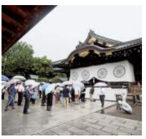
People outside Yasukuni Shrine in Tokyo on Sunday.

Around 200 people participated in the ceremony,