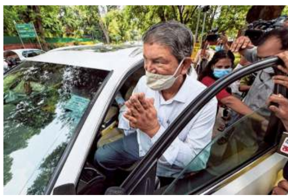
Breaking point: Congress leader Harish Rawat in New Delhi earlier this year.

A day after raising the banner of revolt against Punjab Chief Minister Amarinder Singh, four Ministers and a few Congress MLAs on Wednesday met All India Congress Committee (AICC) in charge of Punjab affairs Harish Rawat in Dehradun, Uttarakhand, to apprise him of their concerns and disappointment against the Chief Minister.