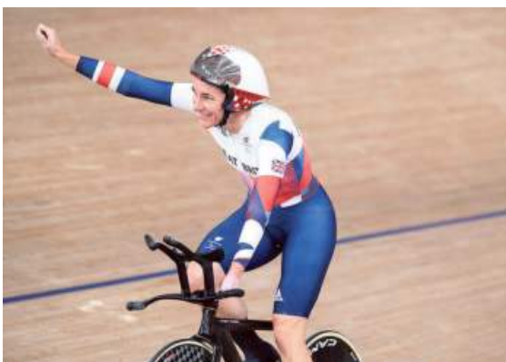
Cycling to glory: Australian Paige Greco is all smiles on the podium, while Britain's Sarah Storey reacts after winning her event.