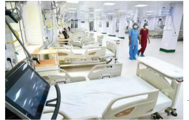
Nurses at the newly inaugurated rapid response centre at Rajiv Gandhi Hospital in Delhi on Wednesday.

It is fully equipped with a centralised oxygen supply. A rapid response team, comprising critical care consultants, resident doctors, nursing staff and orderlies, and technicians will man the