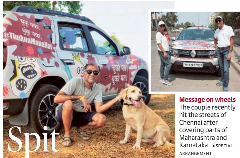
Message on wheels The couple recently hit the streets of Chennai after covering parts of Maharashtra and Karnataka