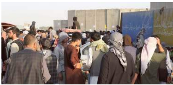
Desperate wait: Crowds near an evacuation control checkpoint at the airport in Kabul on Wednesday.

In a move that could affect hundreds of Afghans desperate to leave the country, India decided on Wednesday to "invalidate" or cancel all visas issued to Afghan nationals, including about 2,000 issued in the last few months, as the Taliban began to make advances across the country.