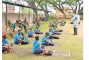
Students sit for a COVID-19 briefing in Bengaluru.

This drive comes even as a technical advisory group on immunisation recommended a strategy to vaccinate children aged 12-17 who have comorbidities by October, followed by a roll-out for all children in that age