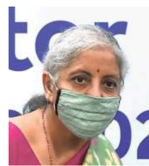
Nirmala Sitharaman

In her interaction with MDs of these banks, she stressed the need for sharper focus on customer service, credit growth to sup-