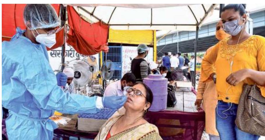
Solid surveillance: A health worker in New Delhi collects a sample for COVID testing, as States continue their efforts to track and trace.

"The reclassification is primarily to assist micro-epidemiology and is not based