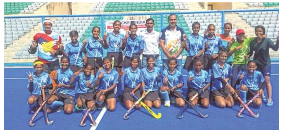
Happy bunch: The Khera Kalan team after winning the Delhi state sub-junior title.