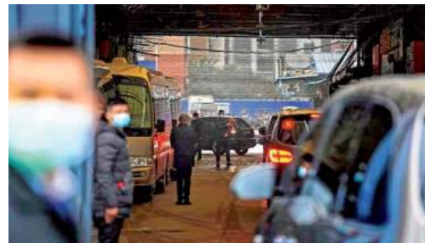
Key inquiry: A convoy of vehicles carrying the WHO team enters the Huanan seafood market in Wuhan on Jan. 31.

In a commentary published in the journal Nature , the WHO-recruited experts said the origins investigation is at