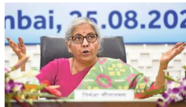
Quick rebuttal: Finance Minister Nirmala Sitharaman said assets had been monetised during the UPA regime too.

"I wish the Opposition questions with some homework done. Who actually monetised the Mumbai-Pune corridor," she asked.