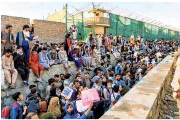
Desperate wait: People outside the international airport in Kabul on Wednesday.

"The sooner we can finish, the better... each day of operations brings added risk to our troops," Mr. Biden said on Tuesday.