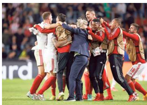
Job well done: The Benfica team celebrates after ensuring it plays in the main draw of the Champions League.