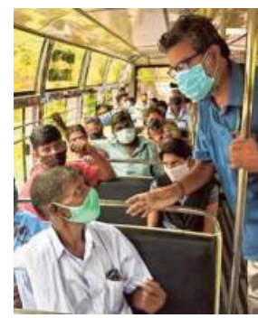
The revised guidelines apply for all modes of transport.

It added that in case RT-PCR or RAT tests are required prior to entry into a