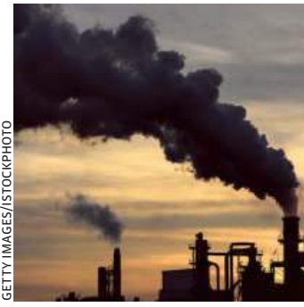
flexibility in the new climate policy.

Whereas, the world's remaining carbon budget – the total amount we can emit to have a chance of limiting warming to 1.5°C – is only 400 gigatonnes of carbon dioxide, and the U.S. alone has contributed this amount for its high standard of living. For a global consensus, such countries will need some