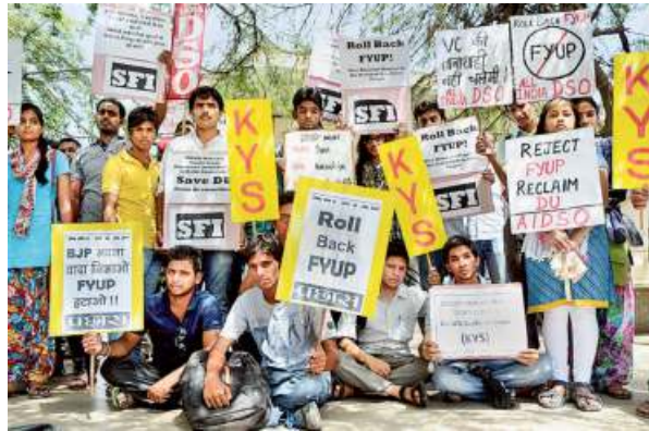
Delhi University students protesting against implementation of the FYUP back in 2013.

DU professors said that the implementation of FYUP would lead to dilution of degrees and the multiple exit model might also be detrimental for students who are from economically backward