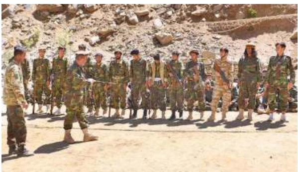
Battle-ready: Afghan resistance forces during a military exercise in Dara district of Panjshir province.

They also spoke of the "importance of establishing peace" in Afghanistan and "preventing the spread of in-