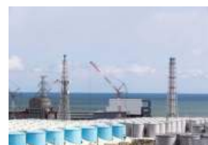
A file photo of the Fukushima Daiichi nuclear power plant in Okuma town.

The operator, Tokyo Electric Power Company Holdings, said it hopes to start releasing the water in spring 2023. TEPCO says hundreds of storage tanks at the plant need to be removed to make room for facilities necessary for the plant's decommissioning.