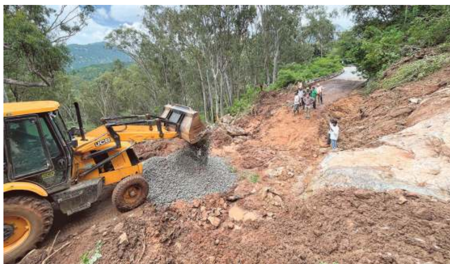
Out of bounds: A landslide at the Nandi Hills 10th curve has washed away the road connecting the hill top for tourists, near Bengaluru on Wednesday.

According to the India Meteorological Department, the southwest monsoon was normal over interior Karnataka and weak over coastal Karnata-