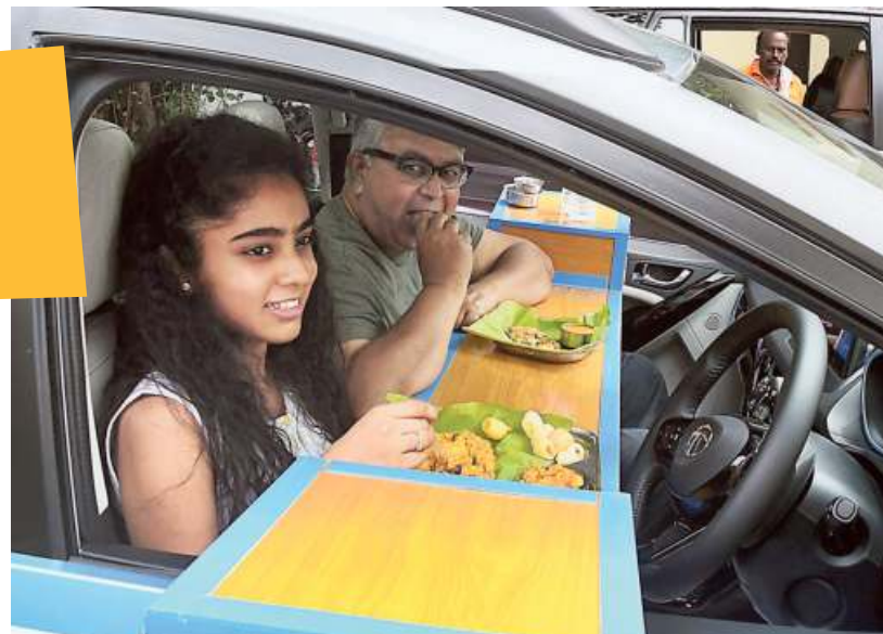
Meals on wheels Drive-in breakfast in Mumbai; game night at Arjun Garden Cafe in Medavakkam; and Sri Kamatchi Mess in Esplanade •