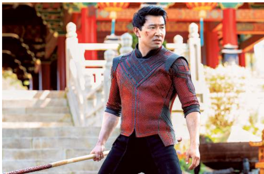
Asian superhero Stills from the film MARVEL STUDIOS 2021