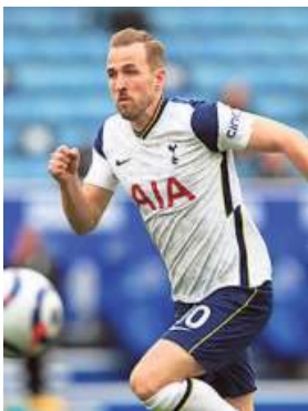
Harry Kane.

Kane, who signed a six-year contract at Tottenham in 2018, was keen on a new