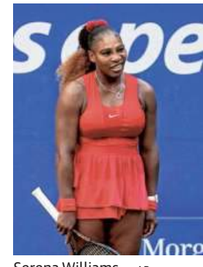
Serena Williams.

tion and following the advice of my doctors and medical team, I have decided to withdraw from the US Open to allow my body to heal completely from a torn hamstring," Serena posted on Instagram.