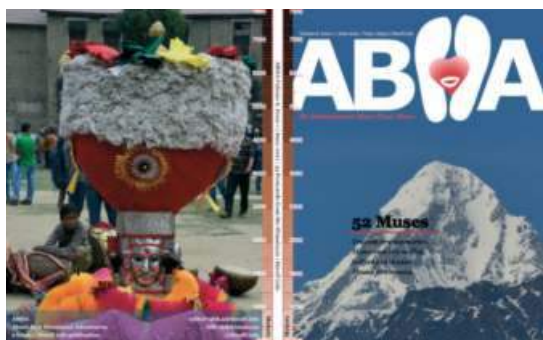
Jacket of ABHA Volume 6, Issue 1, June 2021

Celebrate the Himalaya Day, Sep 9, with fifty-three (53) picture postcards showcasing the loftiest and its gateway. Each card unfolds a Himalayan adventure. Pick your next adventure for less than four rupees (₹4).