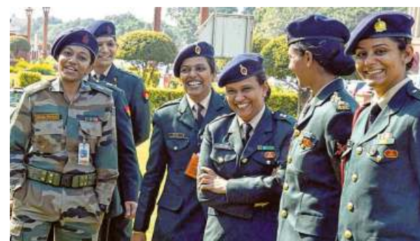
In command: Women officers of the Army have brought laurels to the force, the Supreme Court said.

The Bench asked the government to file an affidavit in this regard by September 22, the next date of hearing. It said the armed forces was a respected institution, but it