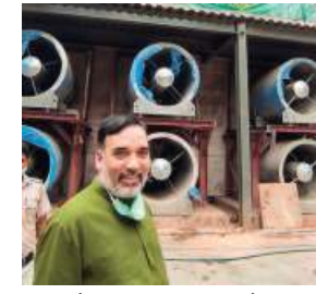
Gopal Rai inspecting the newly inaugurated smog tower in Connaught Place.

"Category 'B' projects requiring environmental clearance will not have to wait for the Central government's approval and approval will now be given in a fast-tracked manner by the Delhi government itself. As much as fast tracking will be a sought after solution, we will also make the system more robust and transparent. Environment protection is one