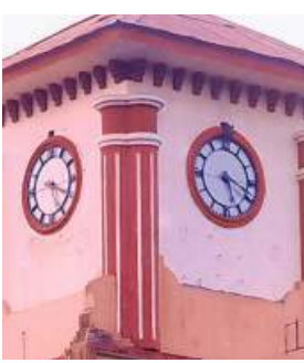
The court said every passenger's time is precious.

The consumer fora, in the same voice, said the Rail-