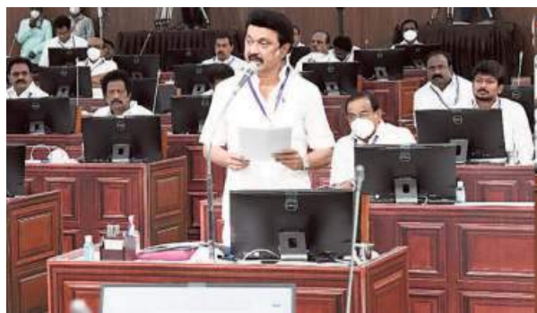
Taking a stand: Tamil Nadu Chief Minister M.K. Stalin addressing the Assembly on Wednesday.

Therefore, to protect India's unity and communal harmony and uphold the secular principles enshrined in the Constitution, "this august House resolves to urge