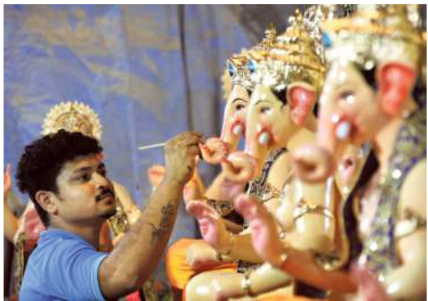
Festive mood: An artist gives finishing touches to a Ganapati idol at a workshop in Lalbaug on Wednesday. ■EMMANUEL YOGINI

Meanwhile, the State reported 4,174 new COVID-19 cases against 4,154 recoveries during the day. The active tally stands at 47,880, while 65 deaths took the total toll