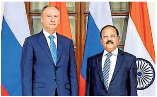
High-level meet: NSA Ajit Doval with Secretary of the Russian Security Council General Nikolai Patrushev in New Delhi.