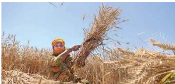
Grain supply: A worker sorting wheat at a farm in Patiala.

PRISCILLA JEBARAJ NEW DELHI The government on Wednesday increased the minimum support price (MSP) for wheat for the upcoming rabi season to ₹2,015 per quintal, a 2% hike from the ₹1,975 per quintal rate of last year.