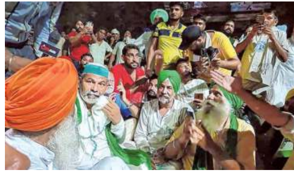
BKU spokesperson Rakesh Tikait with farmers during their sit-in protest outside the mini-secretariat in Karnal.

Jai Kisan Andolan leader Yogendra Yadav said there was not the slightest change