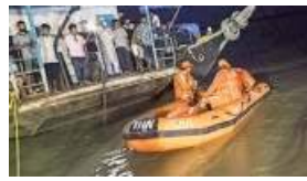
NDRF personnel carrying out rescue work.

board Maa Kamala , which had set sail from Neamatighat for Kamalabari ferry point in Majuli "island", either swam to safety or were rescued.