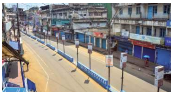
Long road: A deserted street in Dimapur on August 3 during a bandh by the NSCN-IM in protest against the Centre's 'silence' on the Framework Agreement.

The development came days after demands were again raised by some politicians and activists for a new