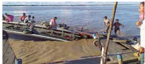
Timely help: Local residents trying to rescue passengers of the ill-fated ferry on Wednesday.

"A communication error between the operators of the two boats perhaps led to the collision," he told The Hindu .