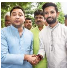
Chirag Paswan, right, with Tejashwi Yadav in Patna.

When asked about RJD chief Lalu Prasad's earlier