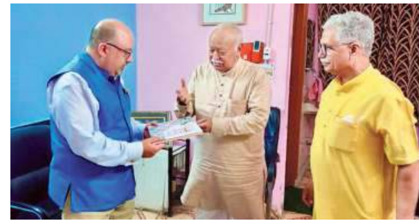
Farewell call: U.S. Acting Ambassador Atul Keshap with RSS chief Mohan Bhagwat in New Delhi on Wednesday.

Mr. Keshap was on a round of farewell calls, and had also met Congress leader Priyanka Gandhi Vadra on Tuesday. He is expected to return to the U.S. shortly, after completing just over two