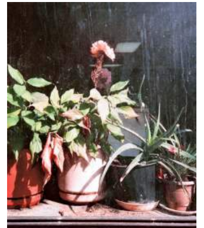
Fleeting frames (Top) Praneeth Reddy's Hew; a frame from Rakshitha Arvind's series of windowscapes • SPECIAL ARRANGEMENT

Praneeth's collection is a series of powerful black-and-white images — all shot in one corner of his room. The four portraits show models in veils, drapes falling in waves across their