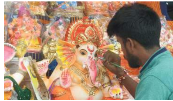
An artist works on an idol of Lord Ganesha ahead of Ganesh Chaturthi in Delhi, on Wednesday.

The DDMA order said it had been decided that Ganesh Chaturthi celebrations may not be allowed in public places. It directed all district officials to ensure that no pandal or tent was erected or any congregation was allowed.