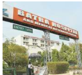
The plant is expected to serve around 150 hospital beds.

Meanwhile, the city reported zero COVID-19 death in 24 hours and the total number of deaths stood at 25,083, as per a bulletin re-