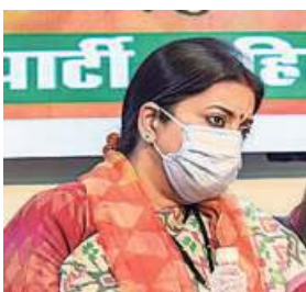
Union Minister Smriti Irani at the meeting in Delhi on Wednesday.

The executive sought to take the opportunity to castigate the Delhi government for allegedly hoodwinking the people of the city in the name of free water and power though they were al-