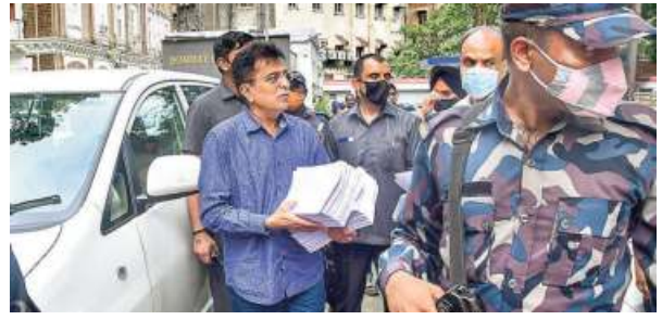
BJP leader Kirit Somaiya arrives at the ED office in Mumbai with papers to back allegations against NCP minister.

He was scheduled to visit the properties owned by Mr. Mushrif in Kolhapur in this regard on Monday.