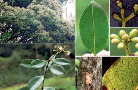
Green gem: Leaves and bark of the Syzygium anamalaianum, a new tree species of the Western Ghats.

The Botanical Survey of India, in its new publication Plant Discoveries 2020 has added 267 new taxa/ species to the country's flora.