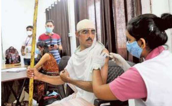
For a cause: A man dressed as Gandhiji as part of a COVID-19 vaccination awareness campaign receiving his second dose at a hospital in Ahmedabad on Monday.