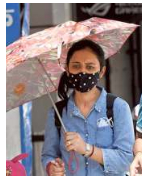
Wearing masks is not only for self-protection but also to protect others, says SC.

Solicitor General Tushar Mehta referred to how mask violations were rampant in several foreign countries. Mr. Mehta said people have started asking for the freedom to not vaccinate and to