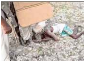
A policeman kicking a man in Dholpur on Thursday.

11 injured as mob clashes with police in Darrang