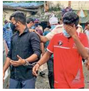
Some of the accused seen at the Manpada police station.

The arrested have been remanded in police custody till September 29. The minor offenders have been sent to a juvenile remand home. Police teams are searching for three others.