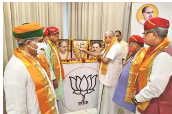
BJP national general secretary B.L. Santosh inaugurating the party's meeting at Kumbhalgarh.

A two-day brainstorming meeting of Bharatiya Janata Party's Rajasthan unit, held at Kumbhalgarh, addressed the issues of weaknesses as an Opposition party and internal differences, while discussing strategies for the 2023 Assembly election. The performance of all the 71 BJP MLAs was also evaluated on the occasion.