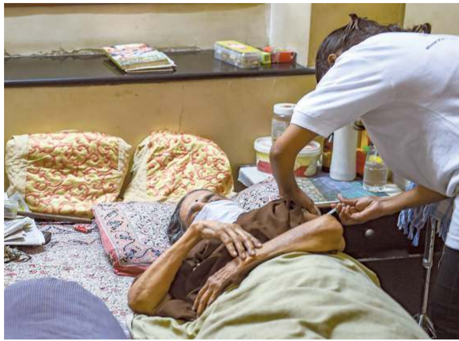
Improving access: All safety protocols will have to be followed during home vaccination.

Speaking at the Health Ministry press conference, he said the government was