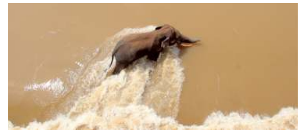
In danger zone: A wild elephant was trapped in floodwaters at Mundali barrage, near Bhubaneswar.

The tusker was stuck near a bridge after it got separated from the herd that was trying to cross the river.