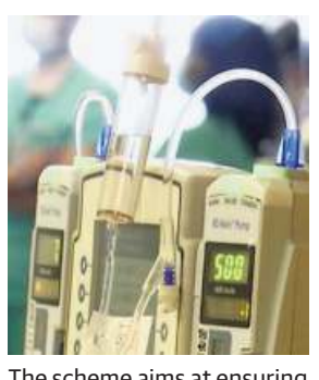
The scheme aims at ensuring easy access to testing and infrastructure facilities.

The financial assistance for a selected medical device park would be 90% of the project cost of common