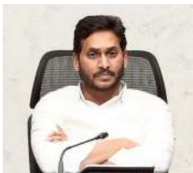
Y. S. Jagan Mohan Reddy

Andhra Pradesh Chief Minister Y.S. Jagan Mohan Reddy has cleared a proposal to fill 14,200 posts in hospitals – from primary health care centres, medical colleges to teaching hospitals – in the State. The process of recruitment will start in October and will be completed by November 15.