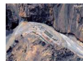
A satellite image of Galwan Valley dated May 22, 2020.

The Ministry of External Affairs (MEA) dismissed the comment, saying it "reject[s] such statements." "Our position with regard to developments last year along the LAC in Eastern Ladakh has been clear and consistent," an MEA spokesperson said. "It was the provocative behaviour and un-