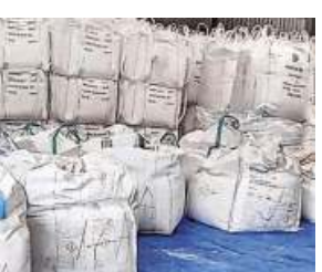
Adani Group officials said they had no authority to check cargo at Mundra Port.

"It will probably go to the NIA," a senior official told The Hindu , adding only a federal agency could probe the case since it involved multiple States and also stakeholders.