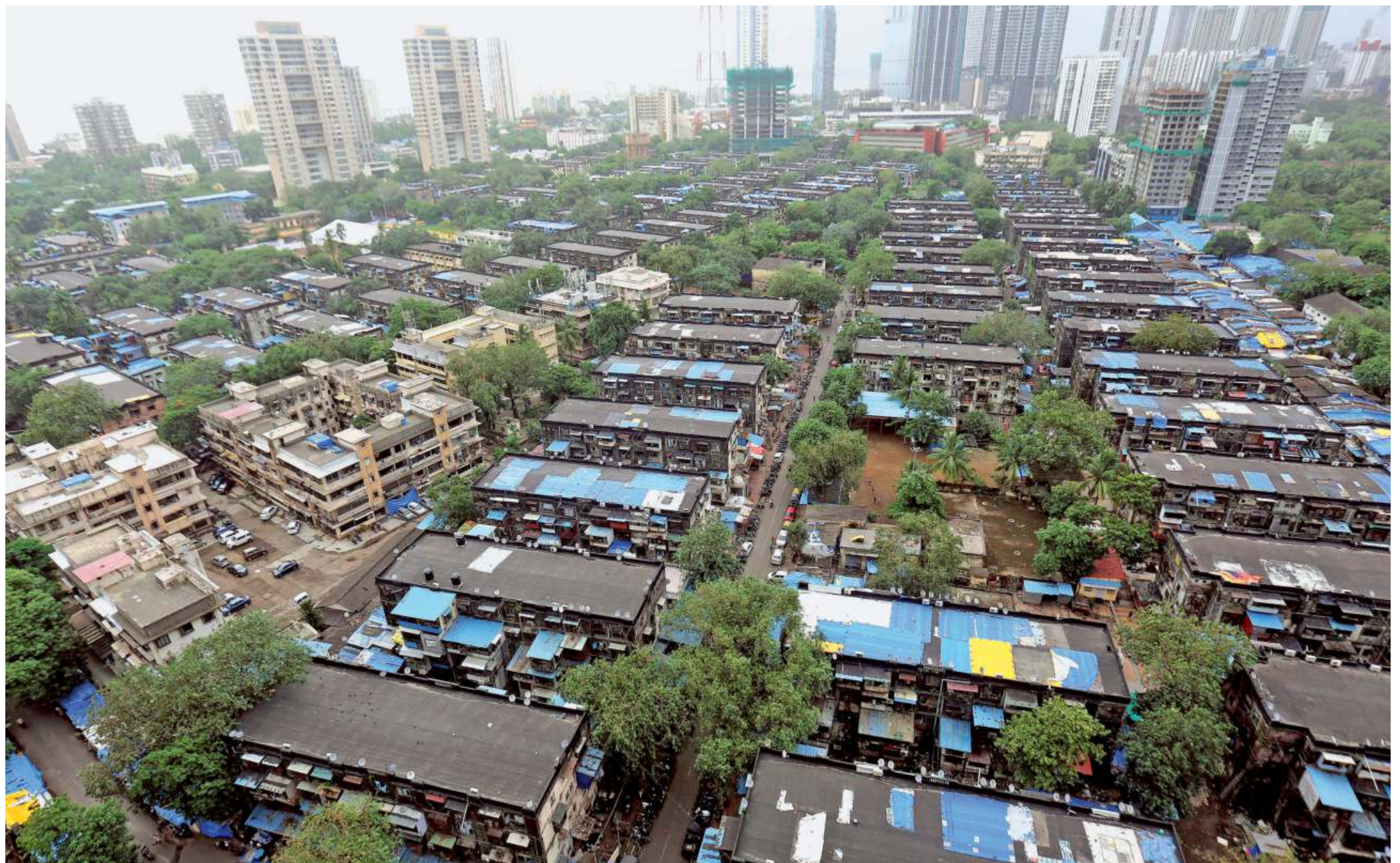
A view of the BDD chawls in Worli. The BDD chawl redevelopment project started on August 1 after the Maharashtra government performed a 'bhoomi puja'.

Sir George Lloyd was appointed Bombay Governor in 1918. He sensed the need for housing and decided that the houses would be built by the government. He raised money through a deve-