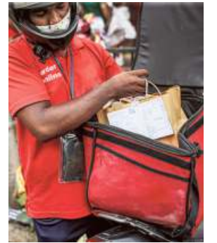
Restaurants have tripled their delivery business during the pandemic.

In the delivery business, packaging plays a crucial role as that is the only way to enhance the customer's experience as it is a brand's