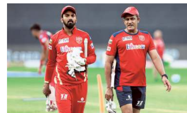
Let's move on: Rahul and Kumble will be keen to put behind the heart-breaking loss against RR.