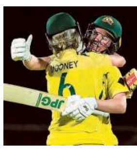
Mooney gets a hug from Carey.

"It was an incredible innings," Smriti said. "Chasing 275 for your team (after being 52 for four) and scoring a century is the best knock