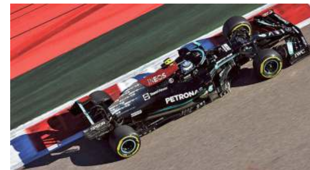
Man with a mission: Bottas, searching for a maiden win this season, made his intentions clear on Friday.

Hamilton's hopes of finally clinching a landmark 100th