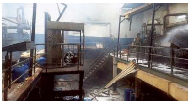
Reason unclear: The factory at Attibele near Bengaluru where the blast occurred on Friday.

Three workers were injured when a solvent vessel exploded accidentally on the premises of a chemical factory in the Attibele Industrial Area on the outskirts of Bengaluru on Friday. The blast resulted in a chemical leak, releasing a pungent odour within a radius of several hundred metres. The incident comes after two fire accidents in the city in the last four days.