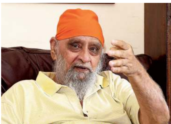
Seasoned pro: As a mentor, Bedi was both tough and fatherly.

Bedi donned many hats, as a player, a captain under whom Kapil Dev made his Test debut, or later as a coach. But Bedi wasn't just about cricket. He had a world-view and his friendships cut across nationalities as evident in his enduring