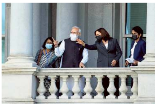
Narendra Modi and Kamala Harris on the balcony of the Eisenhower Executive Office building in Washington.

India and the U.S., being the largest and oldest democracies respectively, were "natural allies" and shared similar values and geopolitical interests. The strengthening of supply chains, technology and space were important areas for both