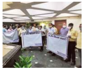
DASS officials protesting inside the Delhi Secretariat building on Thursday.