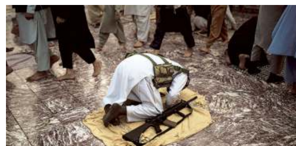
Reneging on word: There have been reports of reprisals against former government and military personnel.

The Taliban's new Defence Minister has issued a rebuke over misconduct by some commanders and fighters following the movement's victory over the Western-backed government in Afghanistan last month, saying abuses would not be tolerated.