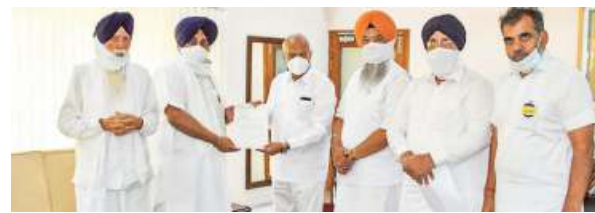
SAD president Sukhbir Badal presenting a memorandum to Punjab Governor Banwari Lal Purohit on Friday.

The party submitted a memorandum in this regard to Governor Banwari Lal Purohit here. Party president Sukhbir Singh Badal said Punjab farmers have been put at a loss of over ₹25,000 crore by the State government's "devious and surreptitious" decision to substan-