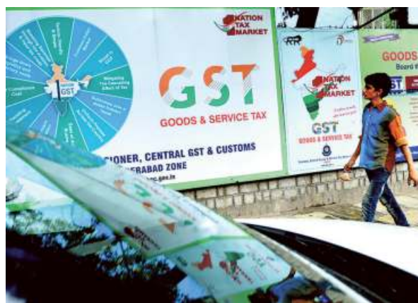
Bigger picture: Rise in GST, direct tax receipts are not small or sporadic indicators, says Sitharaman.

She said the half-yearly target had already been