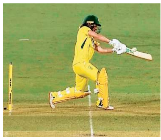
Cruel twist: Jhulan had Carey caught off the last delivery of the 50th over, but the no-ball call changed everything.

India were off to a flying start with the openers Smriti and Shafali racing to 68 in the first 10 overs, their best