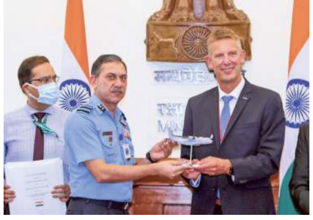
Taking wings: Officials during the signing of a contract between the Ministry of Defence and Airbus Defence.

"For the first time, an Indian private company will be wholly manufacturing an aircraft in India. Tata Advanced Systems Limited (TASL), in partnership with Airbus, will