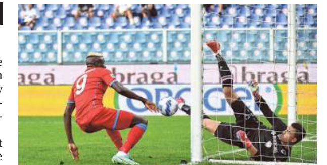
On target: Victor Osimhen bundles in Napoli's first past a flailing Sampdoria goalkeeper Emil Audero.

Koeman was handed a two-match ban by the Spanish soccer federation. He will miss Barcelona's home match against Levante on Sunday as well as the team's visit to defending champion Atletico Madrid next weekend. Barcelona is already seven points behind LaLiga's early leader Real Madrid, albeit having played a game