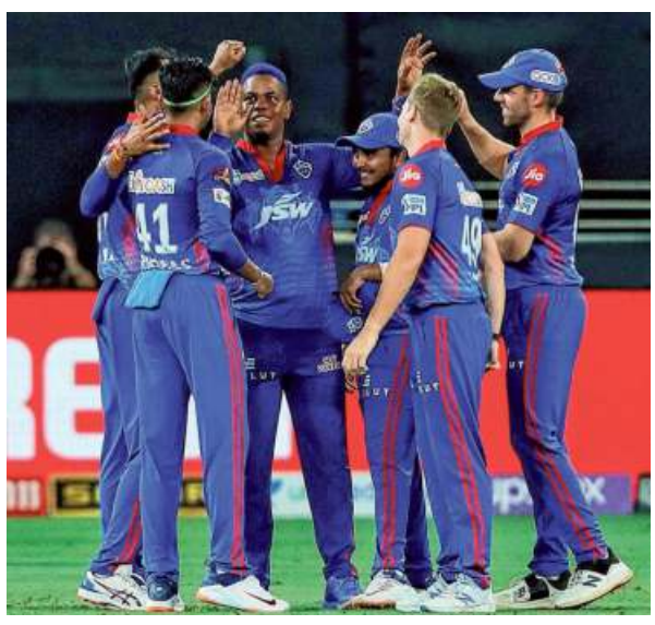
Getting closer: Capitals need just one more victory to make it to the climactic phase.

Dealt a setback by the quartet of withdrawn players — Ben Stokes, Jos