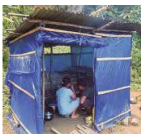
Refugees cooking food at a basic shelter at Farkaw camp in Mizoram.

The Chins of Myanmar are ethnically related to the Mizos of Mizoram. Militias of the former have sided