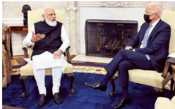
Stronger ties: U.S. President Joe Biden with Prime Minister Narendra Modi in the White House on Friday.

In this context, he mentioned the growing importance of people-to-people