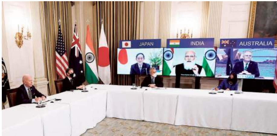
Bolstering relations: Members of the Quad grouping — India, Australia, U.S. and Japan — meeting virtually in the State Dining Room of the White House in Washington on March 12.

China on Friday repeated its increasingly frequent denunciations of the India, U.S., Australia and Japan Quad grouping ahead of the four countries' first in-person leaders summit in Washington, saying the group would "find no support". "China always believes that any regional cooperation mechanism should not target or harm the interests of a third party. A closed, exclusive clique targeting other countries runs counter to the trend of the times and the aspirations of regional countries."