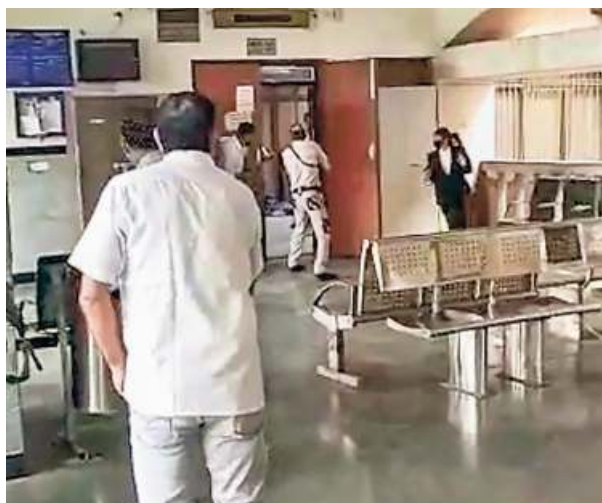
Court rocked: A video grab of security personnel engaging in an exchange of fire with gangsters at Rohini court.