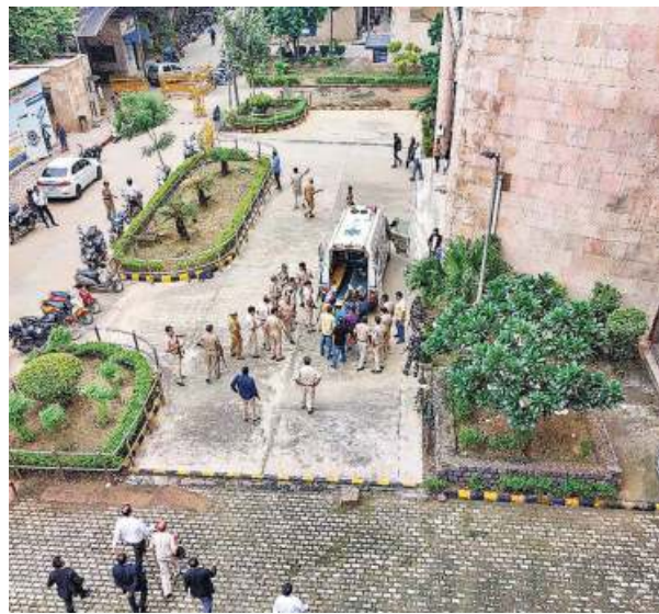
The injured being taken to hospital after the shoot-out at the Rohini Courts Complex on Friday.

room is not very big and there were around 15-17 people present.