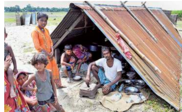
No place to go: Villagers taking shelter on a road after their house was demolished during an eviction drive in Assam.

His friends watched helplessly as he slumped to the