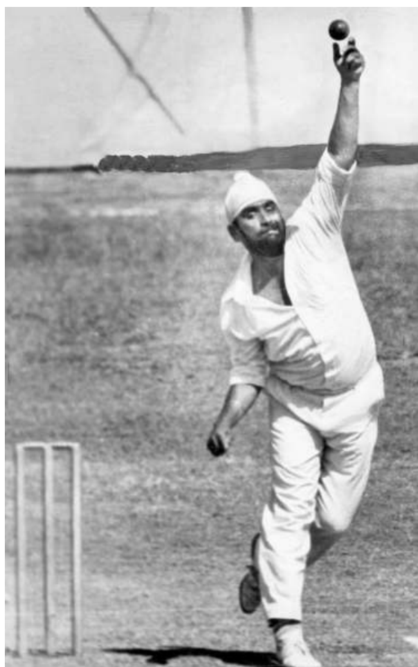
Master of deception: Bedi's deliveries camouflaged the fatality which awaited the batters.

He praised generously, criticised without concealing the hard edge and laughed with abandon