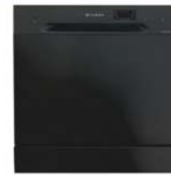
DISHWASHER: FFSD 6PR BS Ace Black