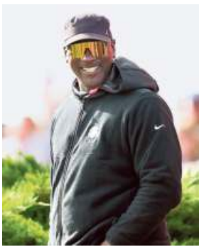
Michael Jordan.

There are six international stars from a half dozen countries, comprising Giannis Antetokounmpo (Greece), Patrick Ewing (Jamaica), Steve Nash (Cana-