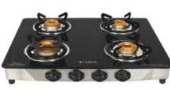
COOKTOP: JUMBO 4BB SS