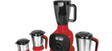
FMG CANDY 1000 3J-1