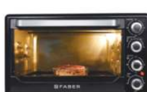
FOTG BK 34L RC