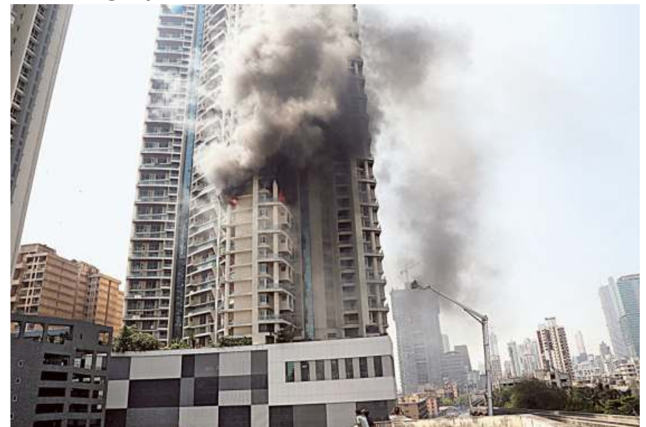
Tall trap: A fire broke out in a 60-storey residential building near the Lalbaug area in Mumbai on Friday. One person died after falling from the 19th floor.