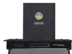
HOOD: 3N1 AEROST. STAR PRO 3D AB TC 60