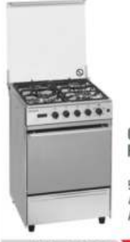
Cooking Range: FCR 52L 4B BEG