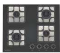
HOB: IMPERIA 604 BRB CI BK