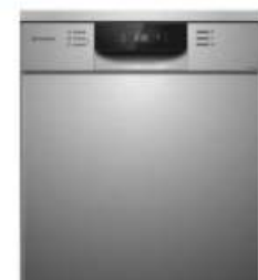
DISHWASHER: FFSD 8PR14S