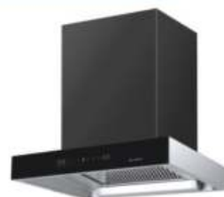
HOOD: JUPITER PLUS HC SC BK 60