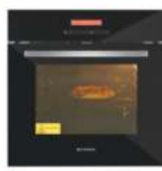
FBIO 67L 10F GLB