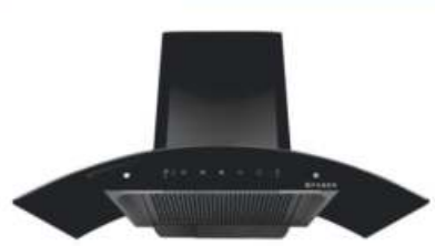
HOOD: SUNNY HC SC BK 90