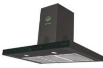
HOOD: STILUX 3D PLUS MAX T2S2 BK TC 90