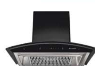
HOOD: CREST 3D PLUS IND HC SC BK 60