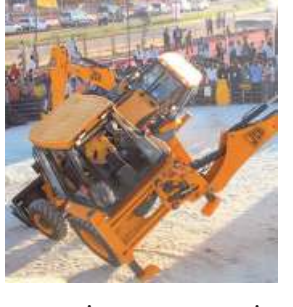
economies are recovering well. So, we are seeing a great opportunity everywhere, but India continues to remain one of the largest and the biggest markets for JCB," he said.