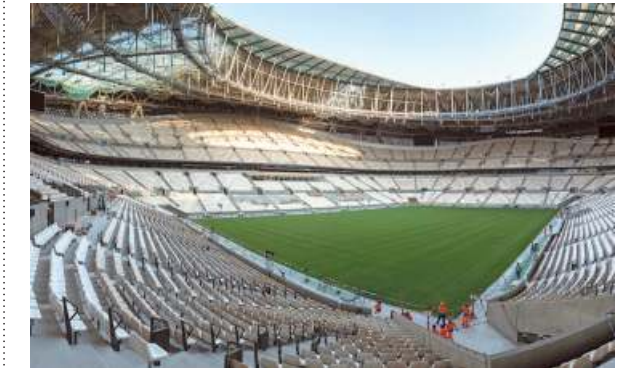
Qatar's pride: The Lusail Stadium will host several World Cup matches, including the final.