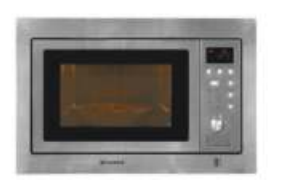
MICROWAVE: FBIMWO 25 LC GS/FG