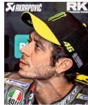
Valentino Rossi.

Large crowd expected The 42-year-old will step onto the track at Misano, the track where he cut his teeth as a rider, for the last time in front of an expected crowd