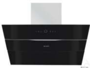
HOOD: BOLT FL SW SC BK 90

MRP - 29990 Offer Price -20990 MRP - 49000 Offer Price - 41890