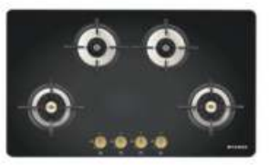
HOB MAXUS HT 904 CRS BR CI AI