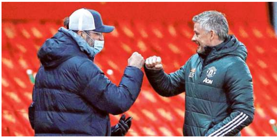
Massive clash: Jurgen Klopp feels Ole Gunnar Solskjaer's United has the firepower to cause problems.

AGENCE FRANCE-PRESSE LIVERPOOL. Liverpool manager Jurgen Klopp denied he was "rubbing his hands together" at the prospect of unleashing his in-form attackers against Manchester United's leaky defence in Sunday's blockbuster Premier League clash at Old Trafford.