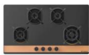
HOB: UTOPIA HT 804 BR CI