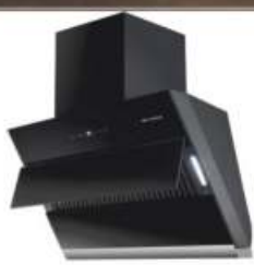
HOOD: ZENITH FL SC AC BK 60

Buy Premia Chimney and get 3 in 1 Dispenser FREE*