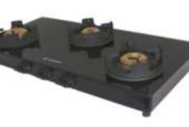
COOKTOP: ONYX 3BB BK CI