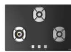
HOB: Nexus IND Ht783 CRS BR CI AI