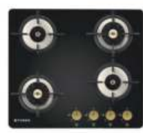
HOB MAXUS HT 604 CRS BR CI AI