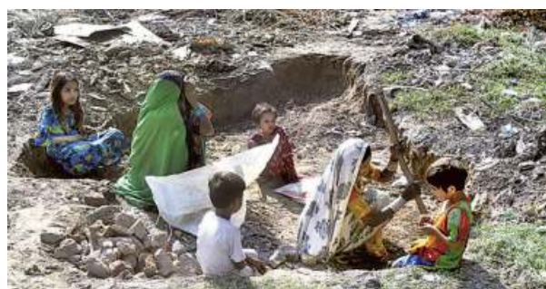
Future tense: A Hindu refugee family from Sindh in Pakistan at the Adarsh Nagar camp in north Delhi.