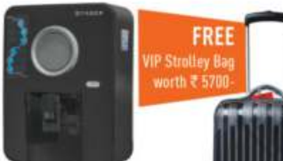
FABER WP: ALTROZ (RO+UV+UF+MAT)