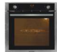
FBIO 80L 8F