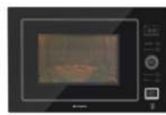
FBI MWO 25L CGS BK