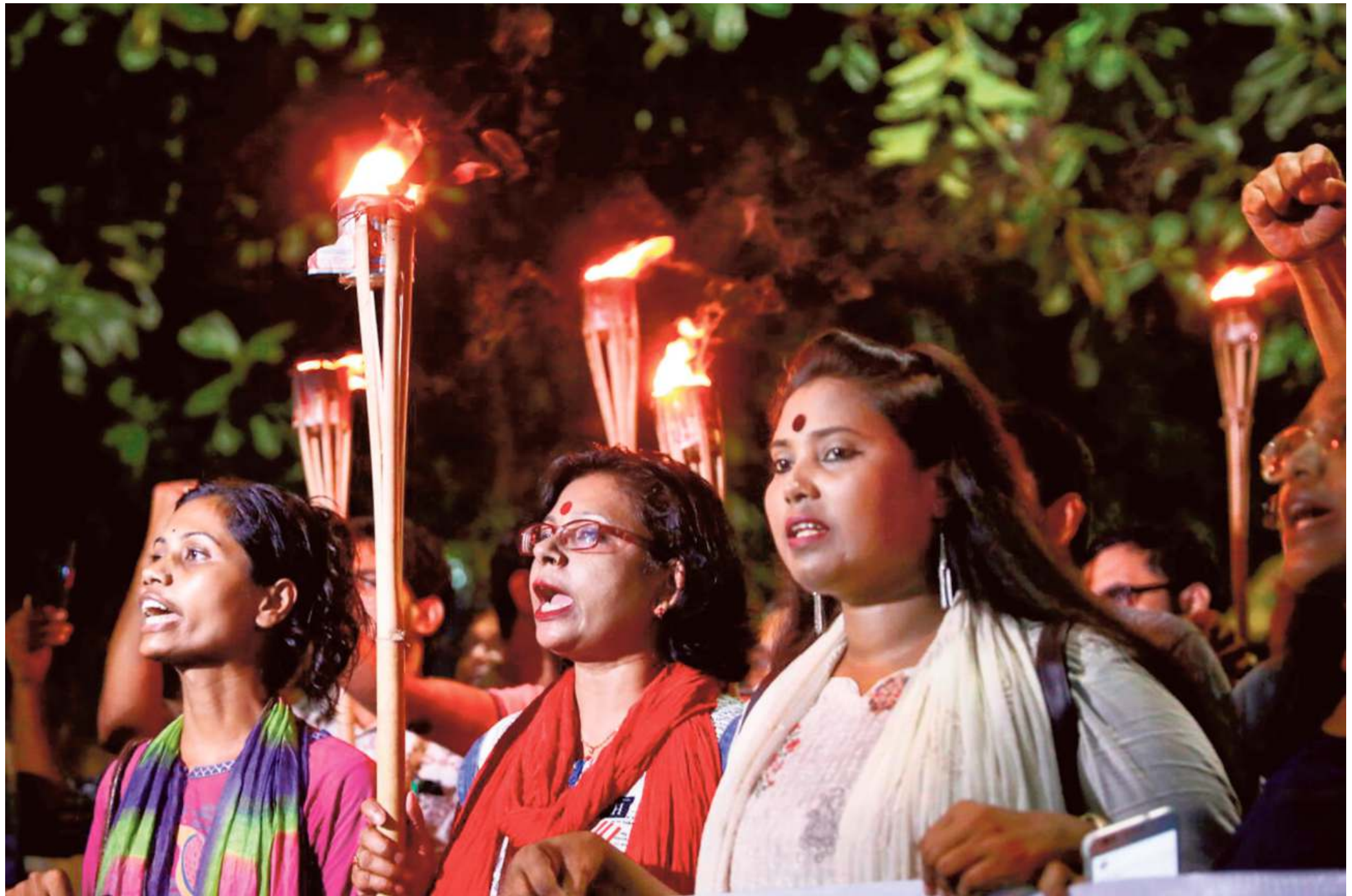
Burning rage: Protesters during a procession demanding justice for the violence against the Hindu community in Dhaka, Bangladesh, on Monday; (below) and cars set alight last week in Noakhali by a mob during a protest over the alleged desecration of the Holy Quran at a Durga Puja venue.