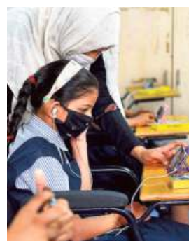
Skewed: Only a few students have been able to access online classes. ■ FILE PHOTO

"During the course of the pandemic, as schools increasingly turned to online education to avoid exposing the young children to the pandemic, the digital divide produced stark consequences... Children belonging to the Economically Weaker Sections (EWS)/Disadvantaged Groups (DG) had to suffer the consequence of not having to fully pursue