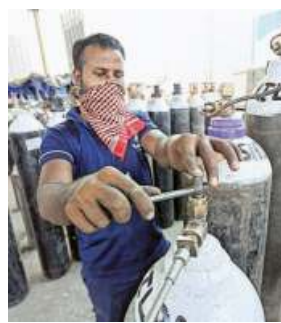
Many hospitals ran out of oxygen supplies during the second wave of COVID-19.

In her response to Mr. Venugopal's notice, Ms. Pawar, on September 10, in a letter