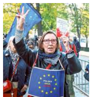
People protesting against the new ruling in front of the Tribunal building.

"Welcome to Belarus!" shouted a group of around 30 protesters outside the court after hearing the ruling, some of whom waved European Union flags.