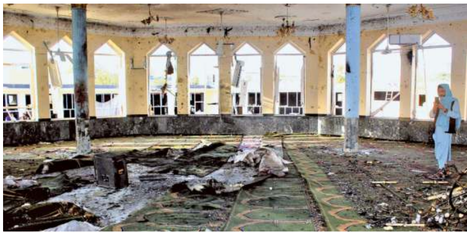
Mangled remains: A man filming inside the mosque in Kunduz, Afghanistan, after the explosion on Friday.

A medical source at the Kunduz Provincial Hospital