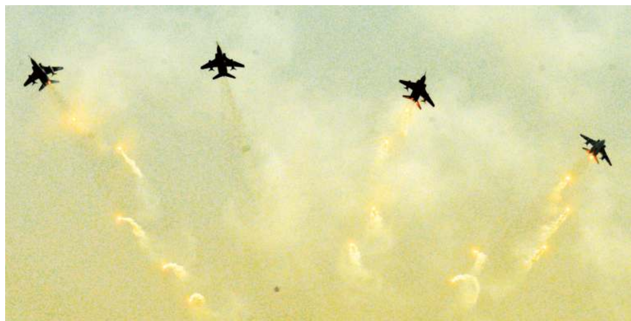
Lighting up the sky: Jaguar fighter jets put up a spectacular show during a parade to mark the 89th Indian Air Force Day at Hindon airbase in Ghaziabad on Friday. (REPORT ON PAGE 10)