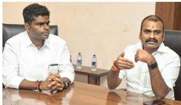
Charting a course: Union Minister of State for Fisheries L. Murugan, right, and BJP State president K. Annamalai at The Hindu office on Friday.

"They [the Cochin Shipyard] have given their opinion. Now, the unit cost may touch ₹1.3 crore. Once the technical nod comes, we will