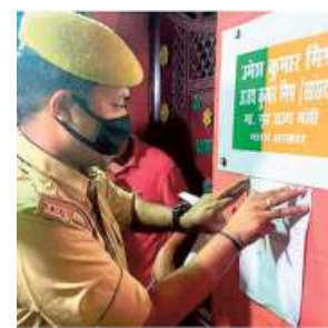
A policeman pasting a notice outside Minister Ajay Kumar Mishra's residence.