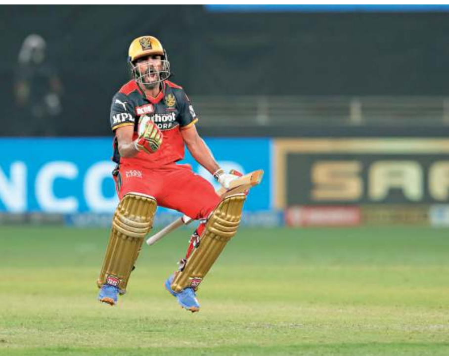
Incredible finish: Bharat is gung-ho after sealing it with a stunning shot.

However, RCB kept up the pressure as Mohammed Siraj removed Shreyas for an 18-ball 18. Hetmyer's 22-ball 29 took his team to a fighting score but it wasn't enough in the end on a night when DC was left to rue squandered chances and sloppy fielding.