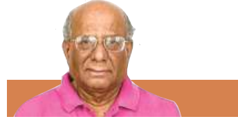
ASWINI K. RAY

Despite a basic structure, Indian federalism needs institutional amendment to be democratically federal