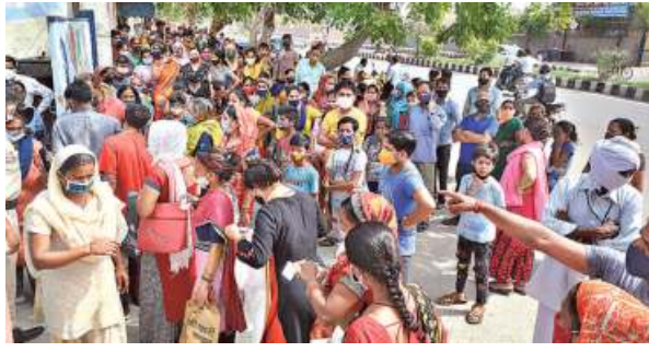
Mid-day ordeal: People in large numbers waiting for free ration at a govt. school in Vishwas Nagar, Delhi.