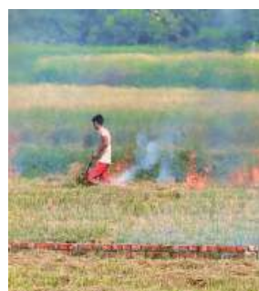
A farmer engaged in stubble burning in Karnal district of Haryana.

The Commission said: "Both Central and State Governments of Haryana, Punjab and U.P. have been taking measures to diversify crops as well as to reduce the use of PUSA-44 variety of paddy. Burning of paddy straw from the non-basmati variety of crops is the prime concern. Crop diversification and moving away from PUSA-44 variety with short duration High Yielding Va-