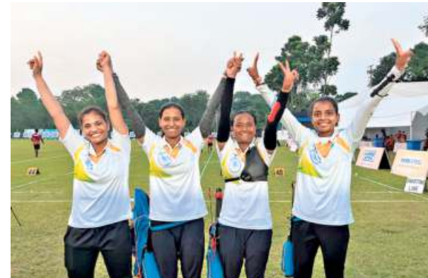
We did it! The Madhya Pradesh team celebrates its maiden recurve title.

"It is a proud moment for us. All these girls are between 16 and 20 years of age and have proved themselves at junior level events. This is