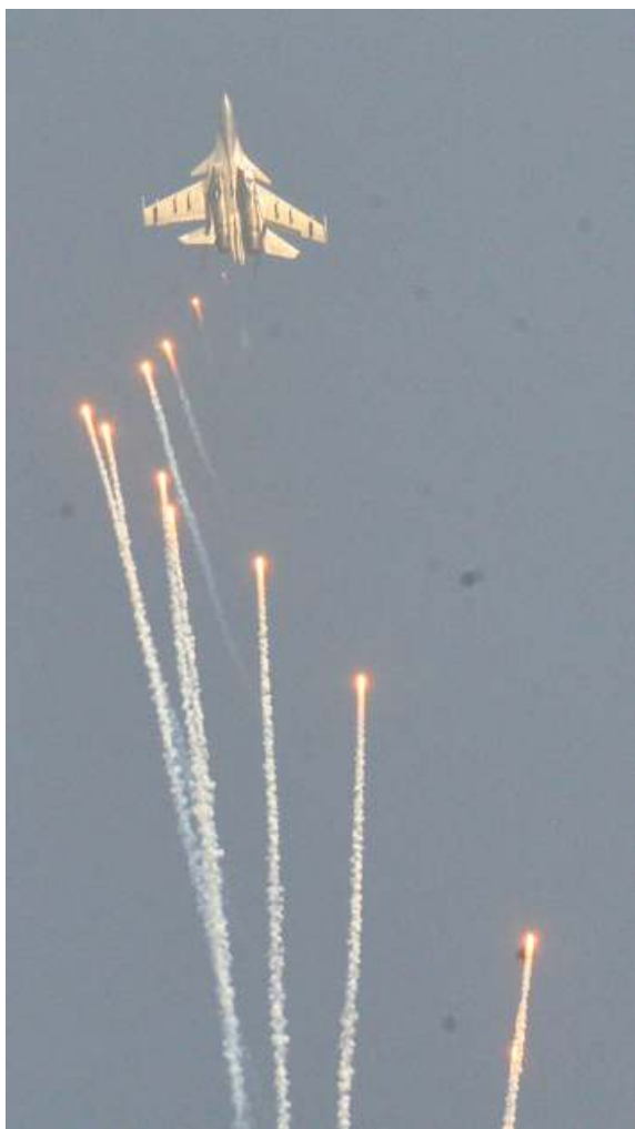
Flying high: (Clockwise from left) Rafale fighter planes, C-17 Globemaster followed by Hawk aircraft, Sarang Advance Light Helicopters and the Surya Kiran aerobatics team at the 89th Air Force Day parade at Hindon Air Base on Friday.

Coinciding with the celebrations of the 75th year of Independence, 75 aircraft and helicopters took part in the Air Force Day parade and fly-past with several formations showcasing some of the key air operations of the 1971 Liberation War of