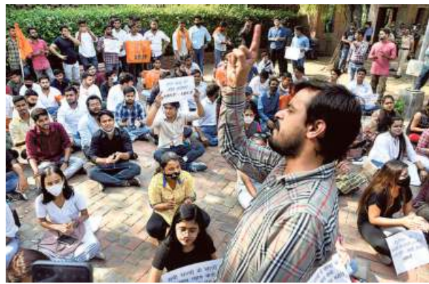
Up in arms: ABVP activists protesting against the admission policy at Delhi University on Friday.

The protests started after several candidates with perfect score from Kerala board