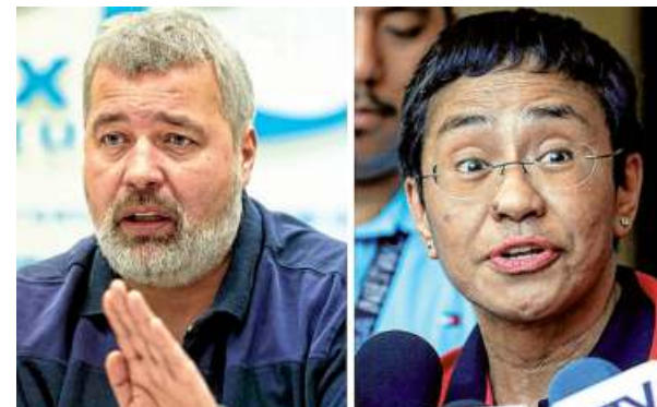
Fresh laurels: Dmitry Muratov, left, and Maria Ressa, who won the Nobel Peace Prize on Friday.

"The newspaper's fact-based journalism and professional integrity have