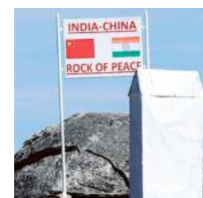
The stand-off comes ahead of Corps Commander-level talks on LAC in Ladakh.

curred as the two sides are set to hold the 13th round of Corps Commander talks for disengagement and de-escalation along the Line of Actual Control (LAC) in eastern Ladakh. The two sides have so far undertaken disengagement from the Pangong Tso and Gogra areas.