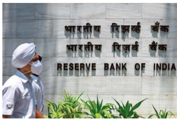
Reaching for reset: The RBI is signalling a gradual move towards 'normalising' policy, says Crisil Research.

"Coupled with other liquidity measures, it facilitated congenial and orderly financing conditions and a conducive environment for the recovery," Mr. Das said after announcing the Monetary Policy Committee's decision to keep interest rates unchanged and retain an 'accommodative' policy stance. "The total liquidity injected into the system during the first six months of the current financial year through open market operations (OMOs), including G-SAP,