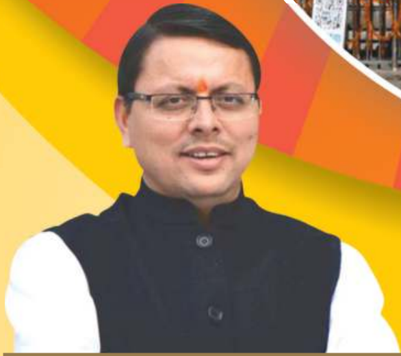
Pushkar Singh Dhami Chief Minister, Uttarakhand