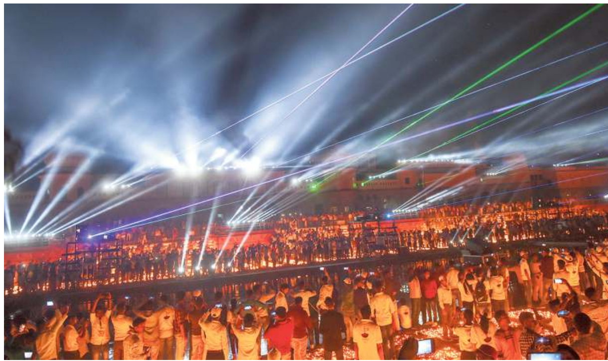
Surreal streaks: A laser show on the banks of the Sarayu river in Ayodhya during Deepotsav, when nine lakh earthen lamps were lit, on the eve of Deepavali, on Wednesday.