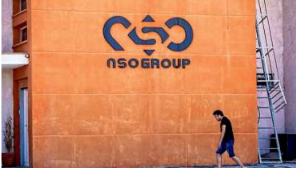
Under lens: An NSO office near the Israeli town of Sapir.

U.S. authorities on Wednesday put the Israeli maker of the Pegasus spyware on a list of restricted companies...