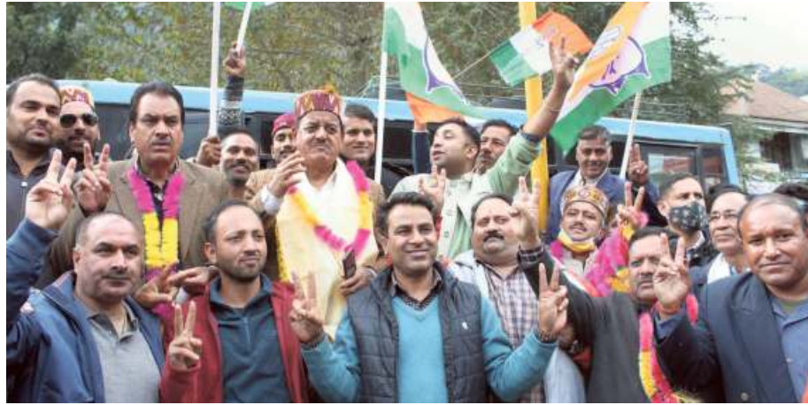
Dealt with a blow: Congress workers celebrating in Mandi in Himachal Pradesh on Tuesday. The BJP lost all the seats they contested in the State.

As COVID-19 protocols are in place, only national executive members of the party who live in Delhi, national office-bearers of the party and Union Ministers who are members of the national executive will be asked to be present in person, while those outside Delhi have been asked to join virtually.