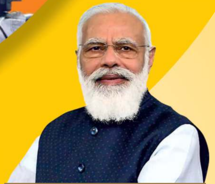
Narendra Modi Prime Minister