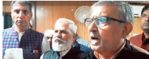
A press conference of Hindu and Muslim leaders after the joint meeting in Gurugram.