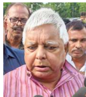
Congress is upset with Lalu Prasad's comments in the run-up to the polls.

State in-charge of the Congress, told The Hindu that the results and the events preceding it would be analysed before the party takes a call.