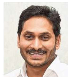
Y.S. Jagan Mohan Reddy

In a letter to Mr. Shah, Mr. Jagan said heavy rains triggered by depression formed on November 18 over Bay of Bengal caused extensive damage to the four