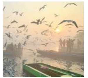
Seagulls flying over the Yamuna on a smoggy Wednesday.

But on Saturday, local surface winds are likely to pick up speed, resulting in improvement of air quality