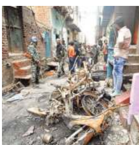
Riot-hit Shiv Vihar in north-east Delhi.

"This court is not insensitive towards the mental agony and financial loss suffered by the complainant due to this incident. However, the sensitivity or the emotions alone are not the factors to be taken into consideration by the court while deciding the fate of any accused," the court stated.