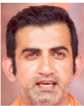
MP Gautam Gambhir