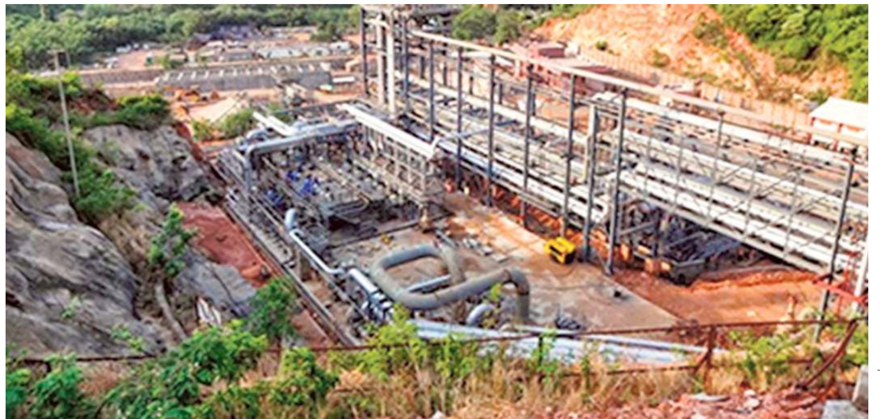
Black gold: A view of the crude cavern of the Indian Strategic Petroleum Reserves Ltd at Lova Gardens in Visakhapatnam, in 2015.

The U.S. Department of Energy (DOE), in a statement on November 23, said that at the direction of President Joe Biden, the Secretary of Energy, Jennifer M. Granholm, authorised 50 million barrels of crude oil from the DOE's Strategic Petroleum Reserve to be made available. According to the PTI