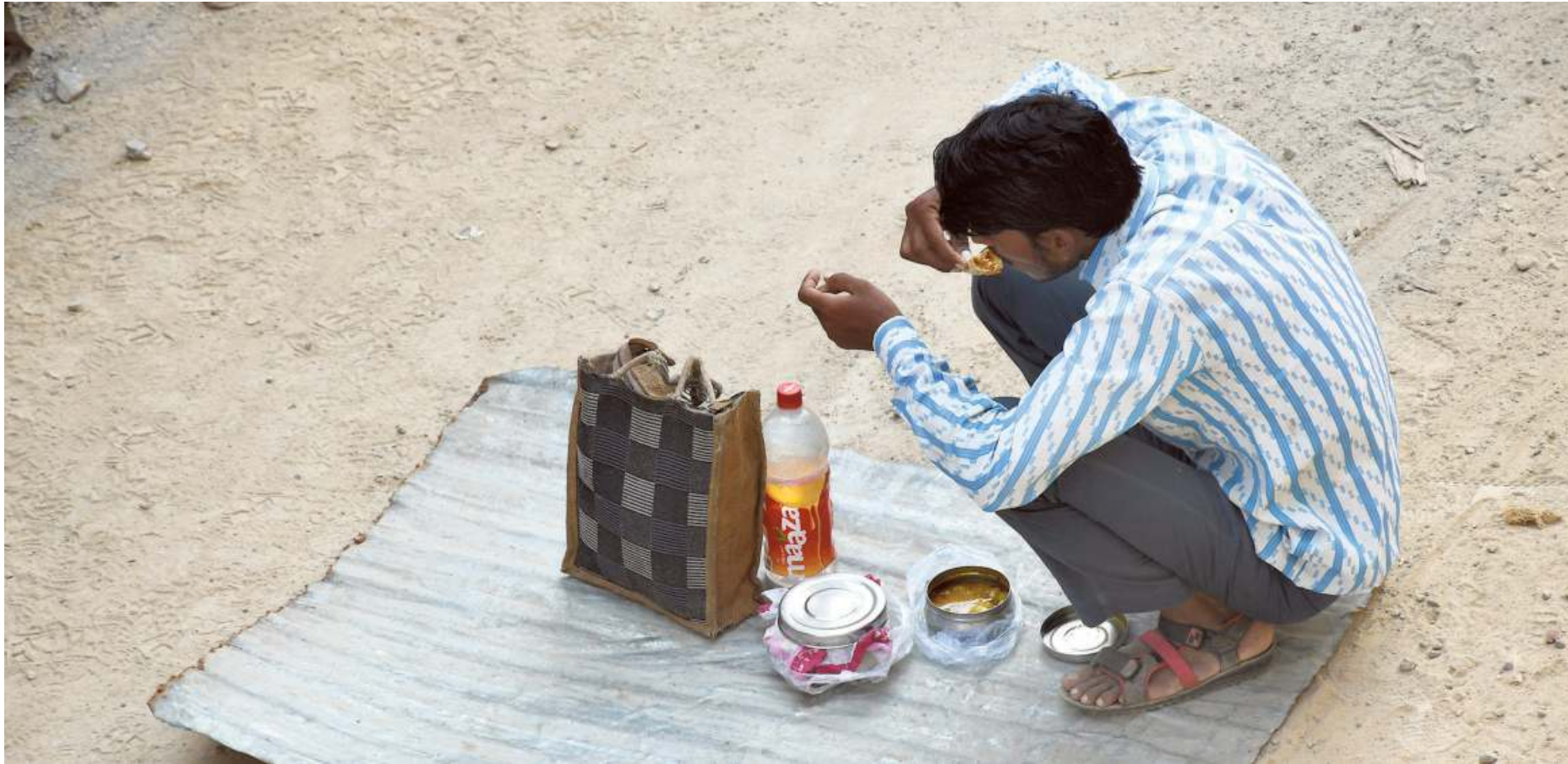
Hard work: A daily wage labourer eats lunch on a piece of tin sheet at a construction site in New Delhi, in 2019.