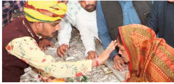
Paying respects: Vasundhara Raje paying obeisance at the Sanwalia Seth temple in Chittorgarh.

Ms. Raje, also party national vice-president, is paying obeisance at some prominent temples in the region