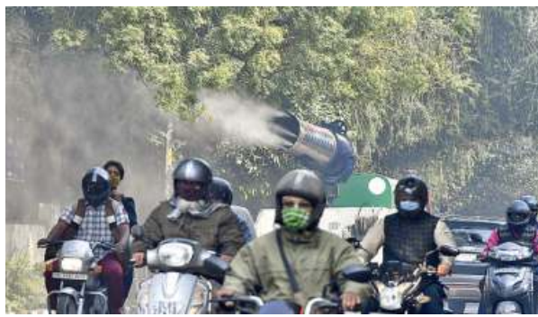
Quick fix: Anti-smog gun being used to curb pollution at Delhi University on a smoggy Wednesday morning.

"Schools, colleges, and institutes will reopen on November 29. All Government offices will also reopen and the work-from-home directive will be lifted. But for this, it is advisable for all Govern-