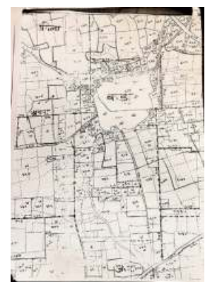
Map of Rohi village.