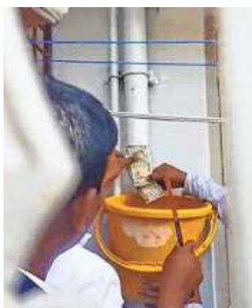
A video grab showing cash found in a pipeline in a Government official's house.

The raids were conducted close on the heels of an ongoing massive operation at the headquarters and other