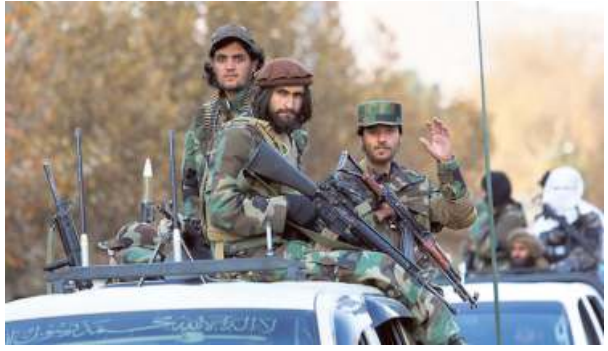
Untapped market: Taliban members atop military vehicles in Kabul earlier this month.