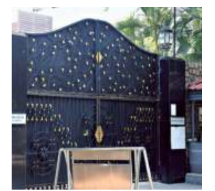
The acquisition of Veda Nilayam will serve no public purpose, said the judge.