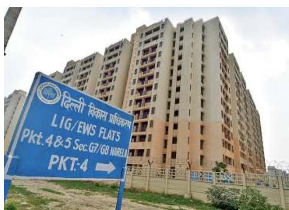
Low income group flats offered by the DDA at Narela in Delhi.

"The flats are being offered at the old rates and the cost in relaxation of the costing policy of the DDA, which is updated every financial year based on the appreciation and depreciation of land price and building as the case may be. The allottees will be eligible for subsidy under the Pradhan Mantri Awas Yojana if they avail of home loan from a bank or a financial institution," the