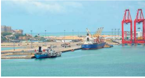
Boosting ties: Colombo Port's East Container Terminal.